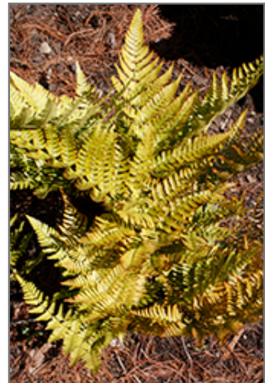
Brilliance Autumn Fern in fall