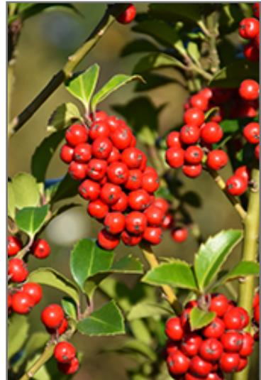
Castle Spire Meserve Holly fruit