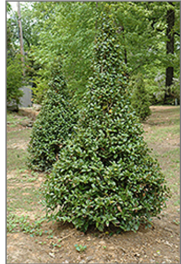
Castle Spire Meserve Holly