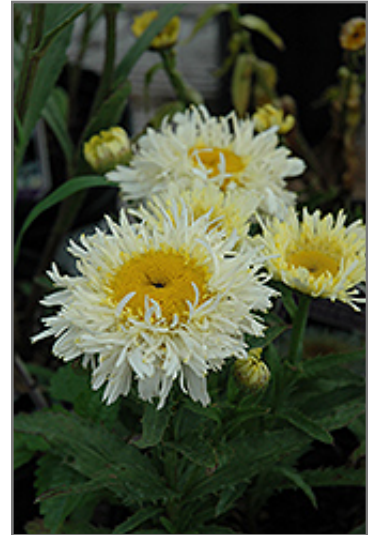
Gold Rush Shasta Daisy flowers