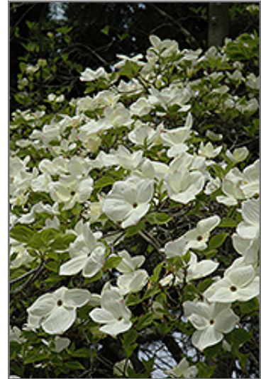
Eddie's White Wonder Flowering Dogwood flowers