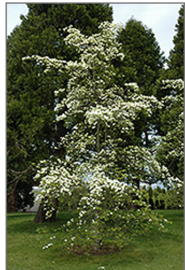
Eddie's White Wonder Flowering Dogwood in bloom