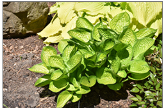
Rainforest Sunrise Hosta