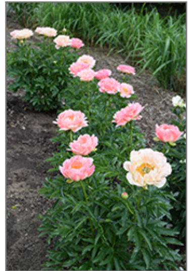
Coral Sunset Peony in bloom

* This is a 'special order' plant - contact store for details