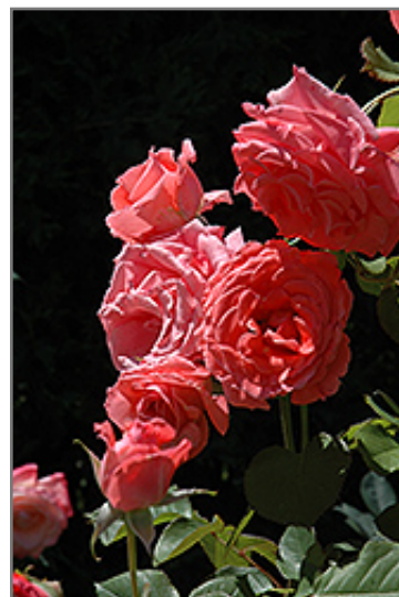
Climbing America Rose flowers