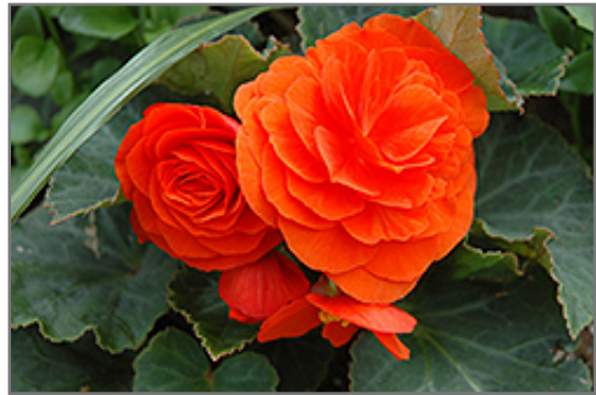
Nonstop Golden Orange Begonia flowers

A spectacular upright begonia presenting lovely dark, heart-shaped foliage; large, colorful double blooms are produced throughout the season; grows well in hot and humid conditions; great for containers, hanging baskets or garden landscapes