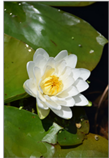
Fragrant Water Lily flowers