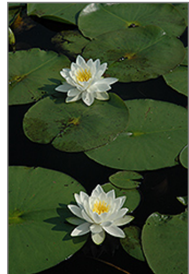
Fragrant Water Lily flowers