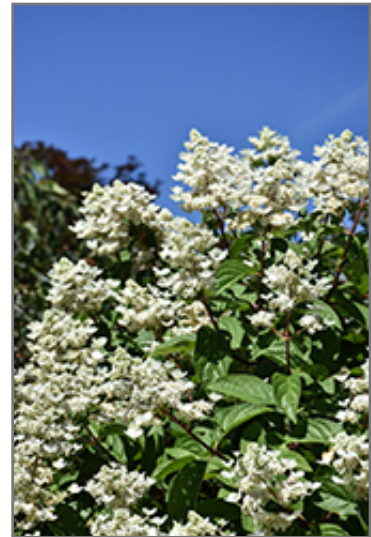
Fire And Ice Hydrangea flowers

Fire And Ice Hydrangea is recommended for the following landscape applications;