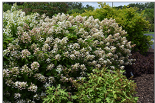
Fire And Ice Hydrangea in bloom