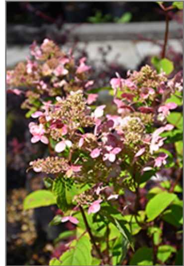
Fire And Ice Hydrangea flowers

Fire And Ice Hydrangea makes a fine choice for the outdoor landscape, but it is also well-suited for use in outdoor pots and containers. With its upright habit of growth, it is best suited for use as a 'thriller' in the 'spiller-thriller-filler' container combination; plant it near the center of the pot, surrounded by smaller plants and those that spill over the edges. It is even sizeable enough that it can be grown alone in a suitable container. Note that when grown in a container, it may not perform exactly as indicated on the tag - this is to be expected. Also note that when growing plants in outdoor containers and baskets, they may require more frequent waterings than they would in the yard or garden.