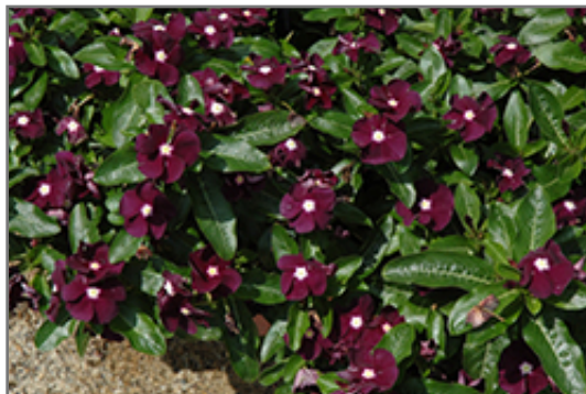
Jams 'N Jellies Blackberry Vinca flowers

Jams 'N Jellies Blackberry Vinca is recommended for the following landscape applications;