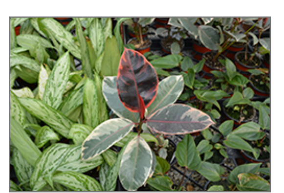
Tricolor Rubber Tree

When grown indoors, Tricolor Rubber Tree can be expected to grow to be about 10 feet tall at maturity, with a spread of 5 feet. It grows at a medium rate, and under ideal conditions can be expected to live for approximately 50 years. This houseplant will do well in a location that gets either direct or indirect sunlight, although it will usually require a more brightly-lit environment than what artificial indoor lighting alone can provide. It prefers dry to average moisture levels with very well-drained soil, and may die if left in standing water for any length of time. This plant should be watered when the surface of the soil gets dry, and will need watering approximately once each week. Be aware that your particular watering schedule may vary depending on its location in the room, the pot size, plant size and other conditions; if in doubt, ask one of our experts in the store for advice. It is not particular as to soil type or pH; an average potting soil should work just fine.