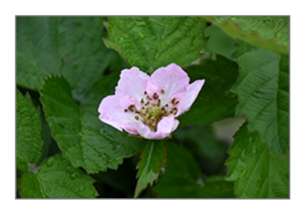
Arapaho Blackberry flowers