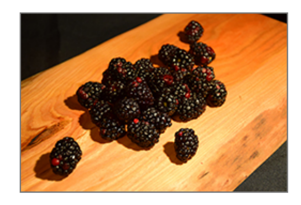
Arapaho Blackberry fruit

Arapaho Blackberry features dainty white cup-shaped flowers with shell pink overtones and tan anthers at the ends of the branches in mid spring. It has green deciduous foliage. The fuzzy oval compound leaves do not develop any appreciable fall color. It features an abundance of magnificent black berries in mid summer.