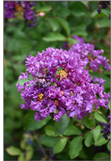
Royalty Crapemyrtle flowers