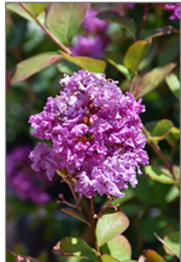
Royalty Crapemyrtle flowers