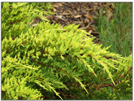
Daub's Frosted Juniper foliage

This is a relatively low maintenance shrub, and is best pruned in late winter once the threat of extreme cold has passed. Deer don't particularly care for this plant and will usually leave it alone in favor of tastier treats. It has no significant negative characteristics.