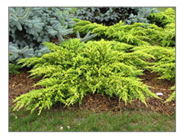
Daub's Frosted Juniper

Daub's Frosted Juniper is a multi-stemmed evergreen shrub with a ground-hugging habit of growth. It lends an extremely fine and delicate texture to the landscape composition which should be used to full effect.