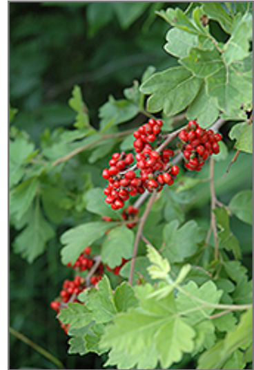
Fragrant Sumac fruit

Fragrant Sumac is recommended for the following landscape applications;