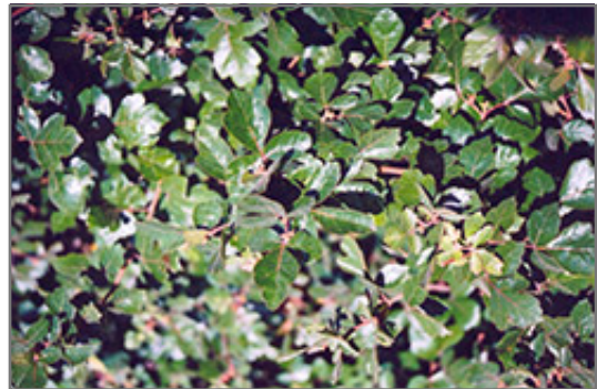
Fragrant Sumac foliage