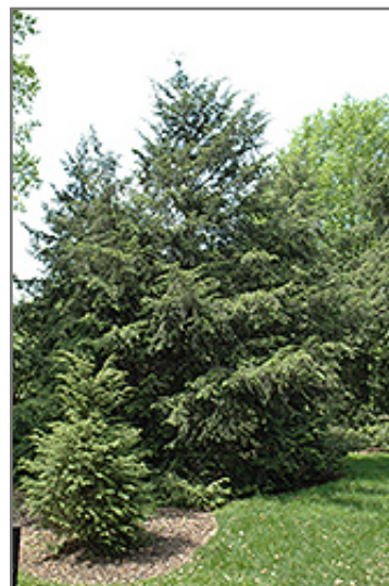
Canadian Hemlock