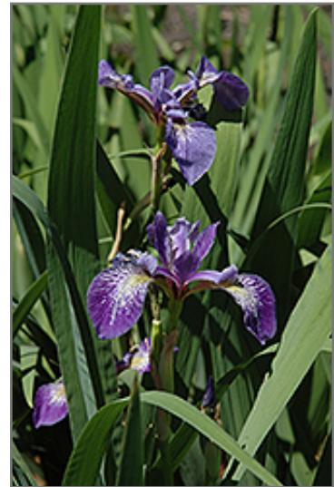
Siberian Iris flowers