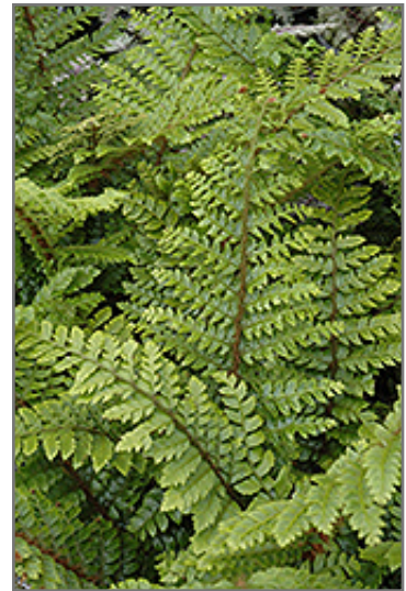
Japanese Tassel Fern foliage