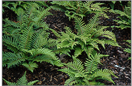
Japanese Tassel Fern

Japanese Tassel Fern is recommended for the following landscape applications;